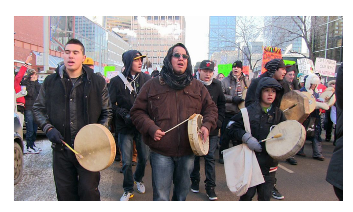
Drummers lead the march from Churchill Square to Canada Place on the Idle No More Global Day of Action on January 11, 2013.