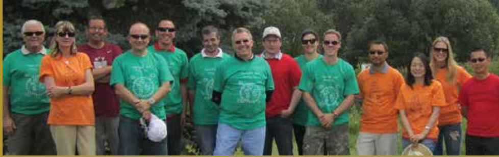
Pictured: Staff from Park Homes