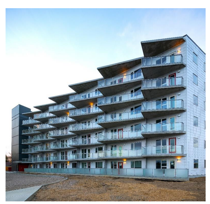
Parkdale ONE. Photo courtesy of GEC Architecture, 2018

CRH manages over 4,500 social housing units contained in 800 buildings across 120 locations in the City of Edmonton, in addition to owning and managing over 600 near market housing units (Capital Region Housing, 2018, p.4).