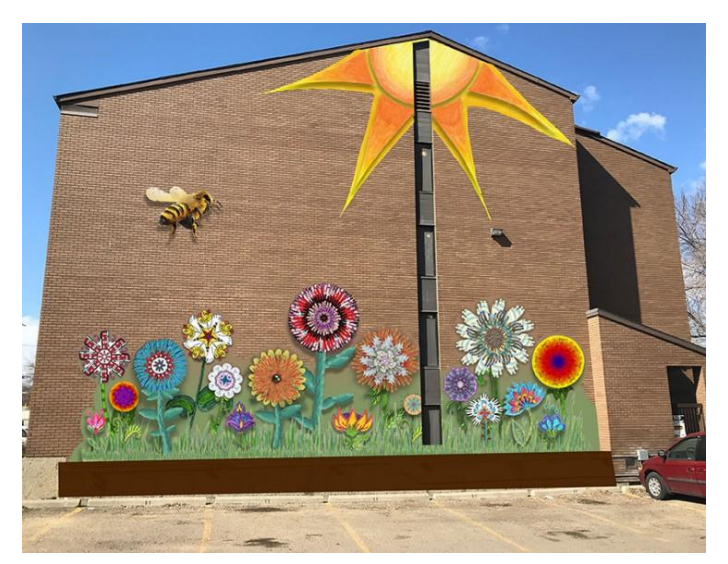
The East Side of McCauley Apartments Taro Hashimoto, 2019

By providing supports and connections to the greater community, e4c's main role involves connecting tenants to the neighbourhood and to other residents in the building. This service encourages tenants to become active contributors in the McCauley