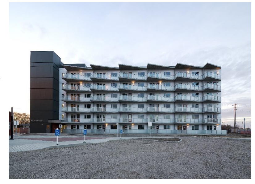
Parkdale ONE.

With a sleek modern design, the additional redevelopment of Parkdale ONE challenges the stigma of what affordable housing should appear to look like. The building is safe, equipped with key fobs and accessible underground parking. Inside the complex, diversity of income, age, and furry friends - Parkdale ONE permits pets! - creates a lively and balanced environment for tenants.