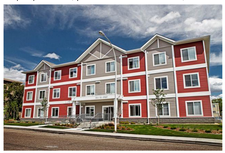
Canora Place

Guests are not allowed in the building after 11 pm or before 8 am without permission from the staff. The staff told researchers "We like to get to know everyone... here because we are here every day... [We like] to get the tenants to introduce their guests and get to know them." (Staff, personal communication, 2019). Canora Place is equipped with surveillance, so staff know if any of the guest management